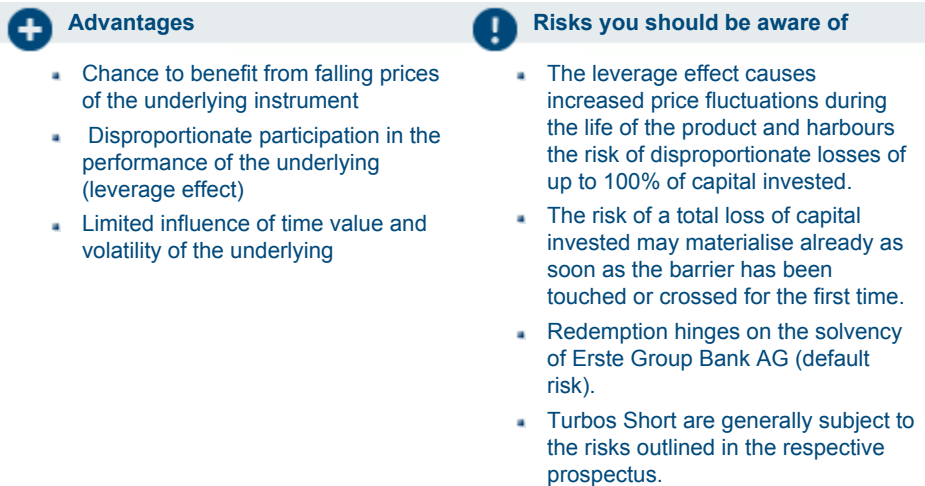
Chart is not available