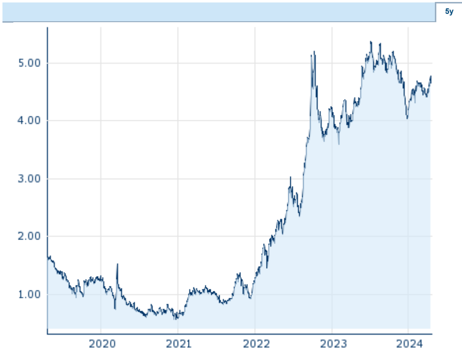
Information about previous performance does not guarantee future performance.