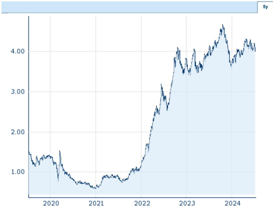
Information about previous performance does not guarantee future performance.