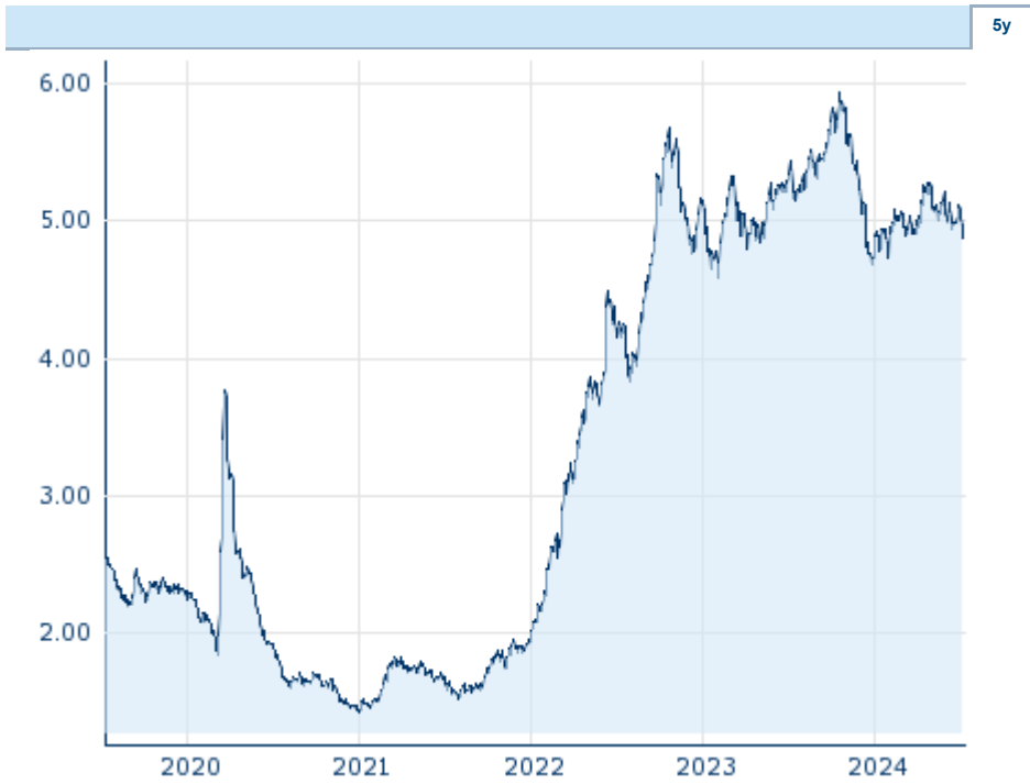
Information about previous performance does not guarantee future performance. Source: FactSet