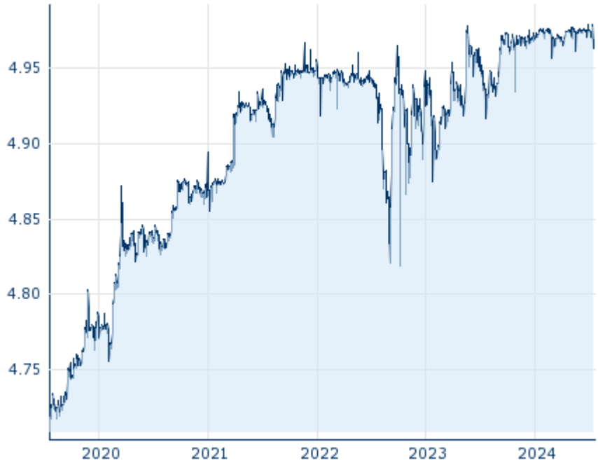
Information about previous performance does not guarantee future performance. Source: FactSet