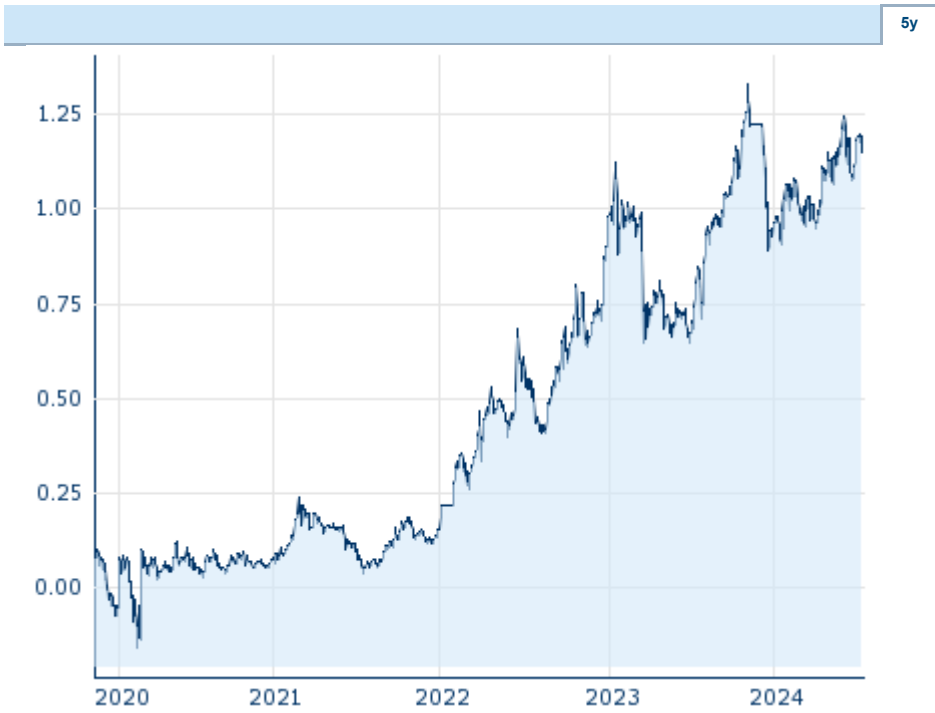
Information about previous performance does not guarantee future performance.