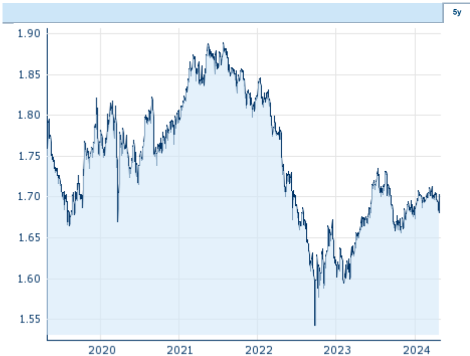
Information about previous performance does not guarantee future performance.