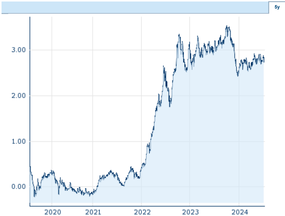
Information about previous performance does not guarantee future performance.