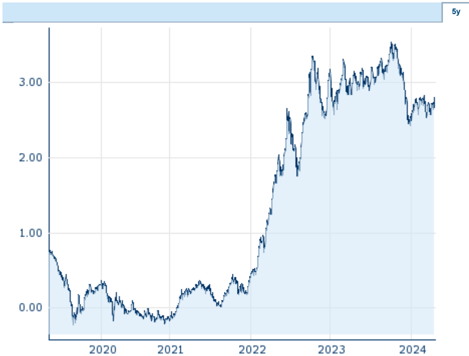
Information about previous performance does not guarantee future performance.