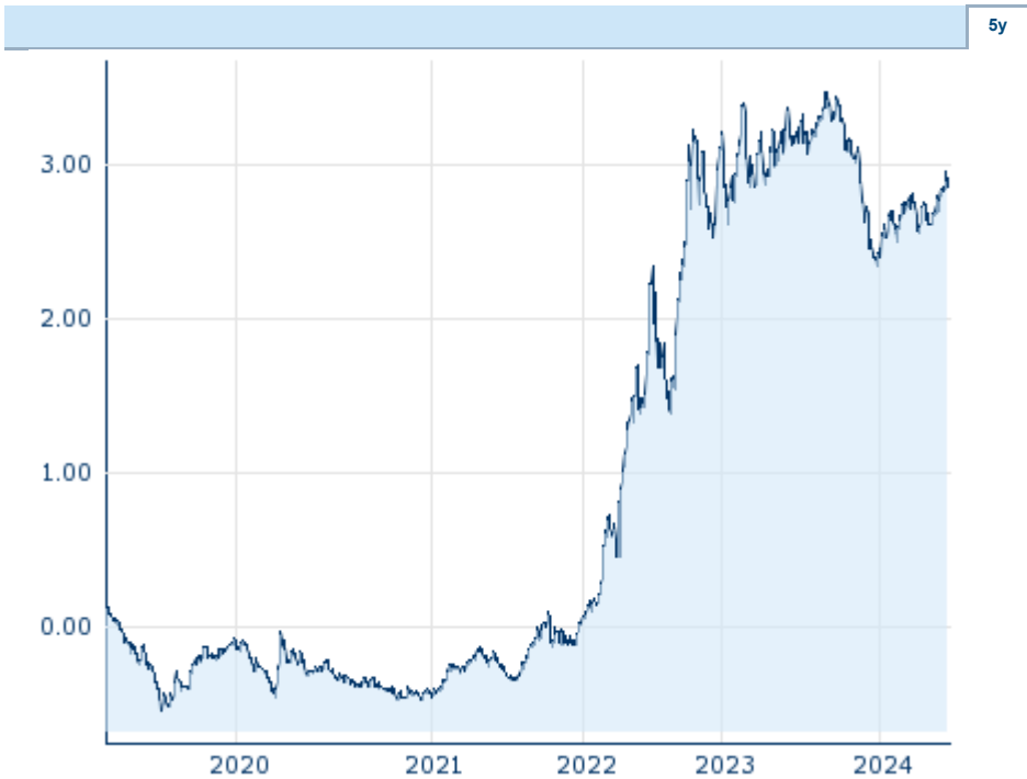
Information about previous performance does not guarantee future performance. Source: FactSet